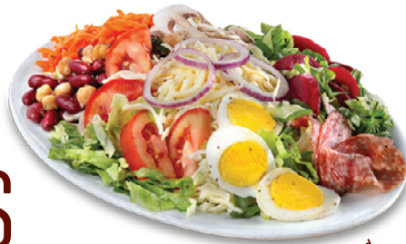
Mary's Signature Entrée Salad

ADD-ONS + grilled chicken or tuna salad for 4.25 + avocado for 1.50