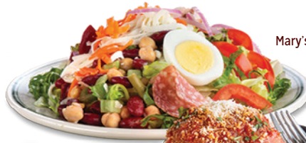
Mary's Signature Side Salad

Lightly breaded chicken breast smothered in homemade marinara sauce and melted provolone, served on a bed of creamy fettuccine Alfredo.