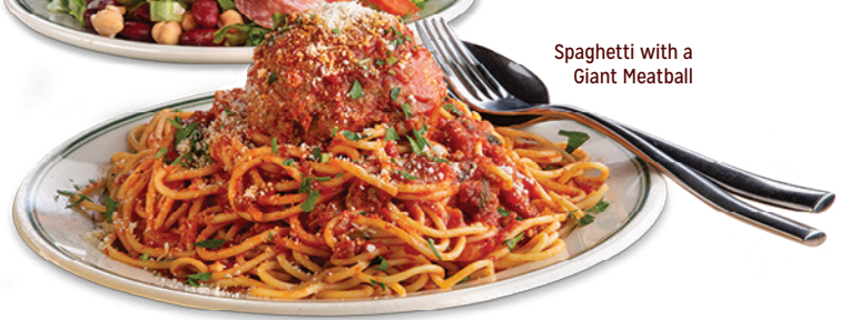
Spaghetti with a Giant Meatball